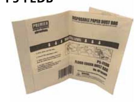
Dust Control Bags AP10509

E sales@premierdiamondproducts.co.uk T +44 (0) 1227 711 555